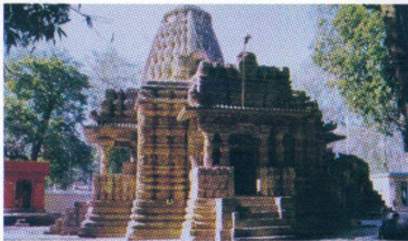
THE BORAMDEO TEMPLE

VENUE – Pt.J.N.M. MEDICAL COLLEGE, RAIPUR C.G. DATE 11 th , 12 th & 13 th February 2012